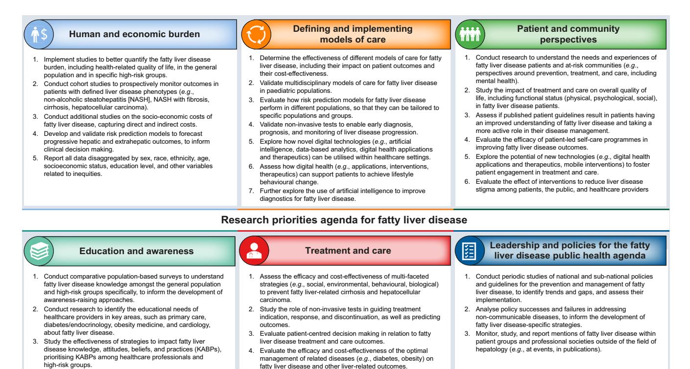
Fig. 2. Research priorities agenda for fatty liver disease.

From the local to the global level, public health policy responses to fatty liver disease have, to date, not stemmed the increase in fatty liver disease morbidity or mortality.<sup>31,34,96</sup> A global review of policies, strategies, and guidelines conducted in 2020 found that of 102 countries assessed, around one-third