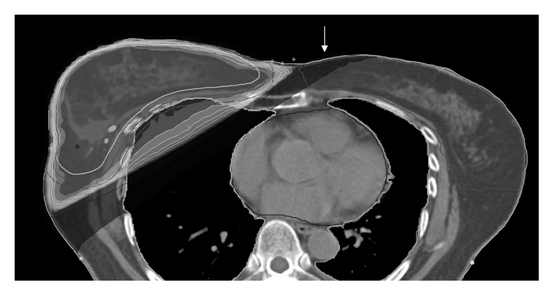
Figure 1. Example of 3D-CRT planning, showing 1% to 5% of the total prescribed dosage (darkest shaded area, white arrow) on the contralateral breast as a result of the breast anatomy or tumor localization (more likely if medial). 3D-CRT = 3-dimensional-conformal radiation therapy.

regular intervals, depending on country. Data on any cancer incidence, tumor characteristics, and treatments were collected through the respective national/regional cancer registries or pathology reports. To ensure sufficient power per individual study, we included only studies with at least 10 incident CBCs.