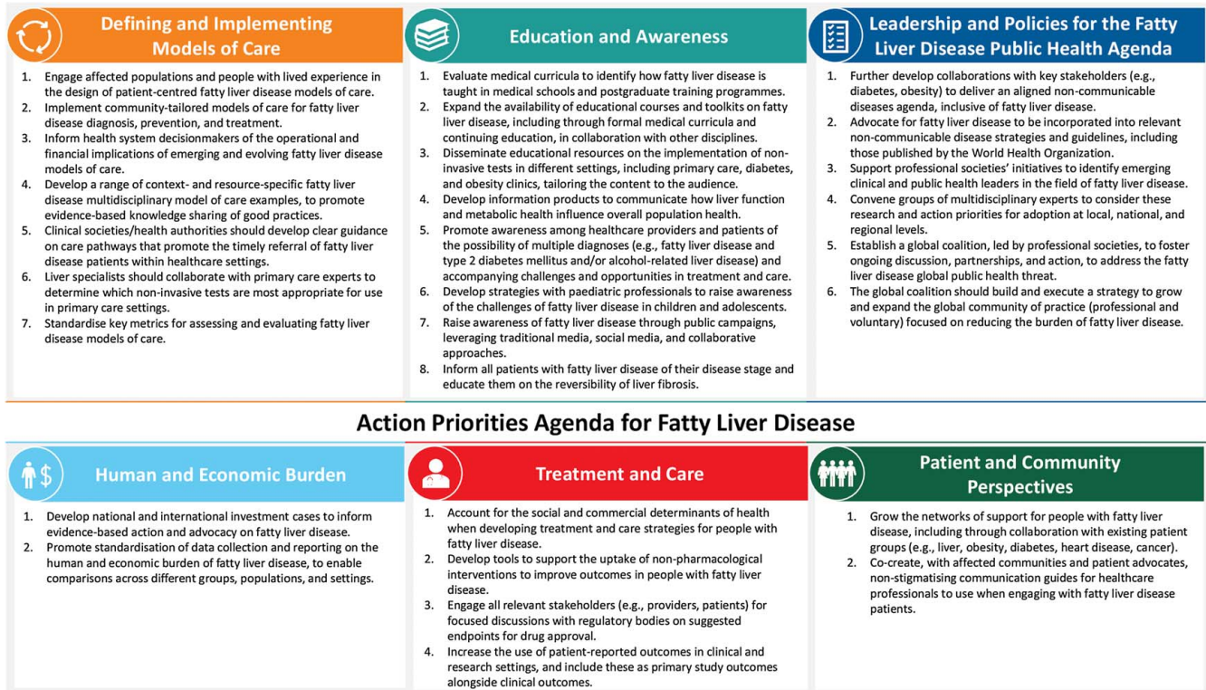
FIGURE 2 Action priorities to turn the tide on fatty liver disease.

the importance of action but the health and economic benefits of this.