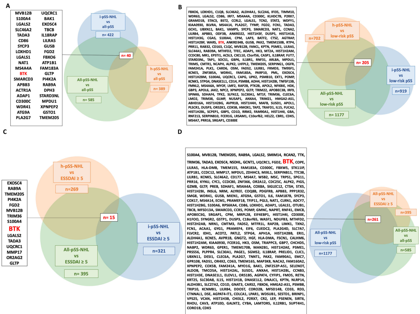
Figure 3. The BTK gene was the only B cell-associated gene among the overlapping genes across all comparisons. A–D , Venn diagrams showing the number of up-regulated overlapping genes between all groups with lymphoma (i-pSS-NHL, h-pSS-NHL, and all-pSS-NHL) compared with groups without lymphoma (all-pSS controls [A and D], low-risk pSS controls [B and D], and pSS with ESSDAI \geq 5 controls [C and D]). See Figure 1 for other definitions.

and patients without lymphoma and with ESSDAI \geq 5 (OR 13.9, 95% CI 2.2–89.4; P = 0.006 ). We observed the same associations with BTK and lymphoma in bivariate models adjusted for each of the following validated risk factors of lymphoma in primary SS: previous parotid swelling, purpura, lymphocytopenia, CD4/CD8 ratio \leq 0.8 , RF positivity, cryoglobulinemia, monoclonal component, and low C4 level for the comparison with ESSDAI \geq 5 controls and the same factors and ESSDAI \geq 5 for the comparison with all-primary SS controls (Supplementary Table 7, available on the Arthritis & Rheumatology website at https://onlinelibrary.wiley.com/doi/10.1002/art.42550 ).