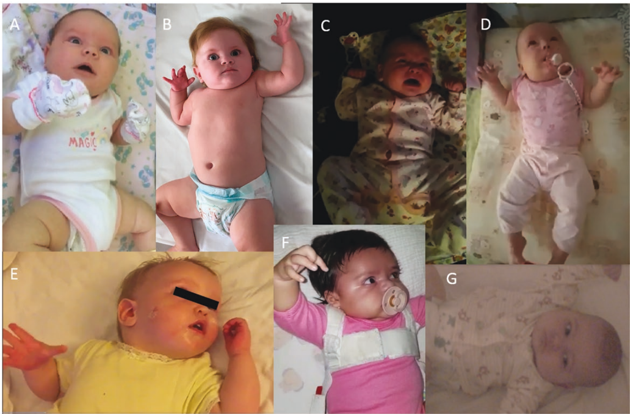
Figure 1. Mosaic of screenshots from several videos showing seizures in sleep mimicking night terrors. (A) Patient 12 at the age of 1 month. (B) Patient 8 at the age of 4 months. (C) Patient 29 at the age of 3 months. (D) Patient 25 at the age of 2 months. (E) Patient 1 at the age of 8 months. (F) Patient 22 at the age of 1 month. (G) Patient 26 at the age of 2 months. Notice common facial expression with staring, crying, and arms extension in all patients.