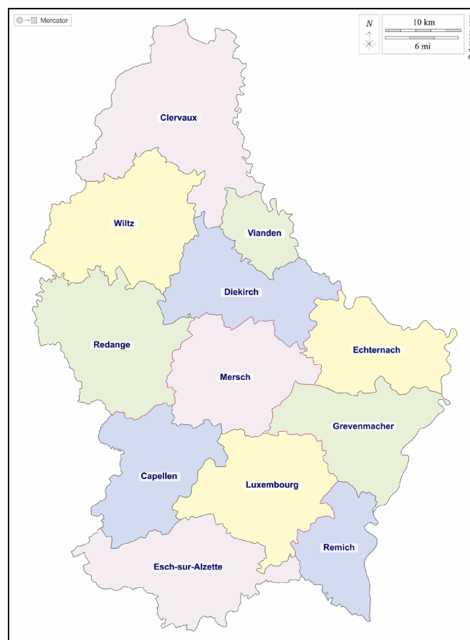
Figure 1 Map of Luxembourg cantons.

where y is unmet need due to wait, distance or affordability and X is a vector of explanatory variables.