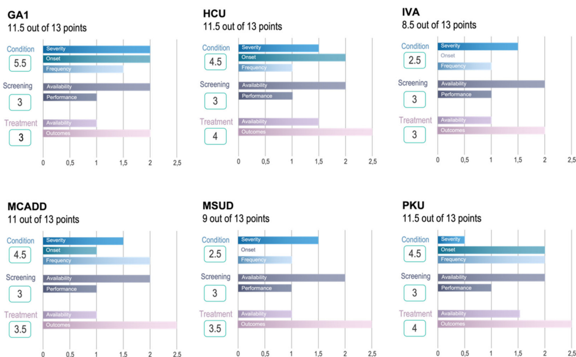
Figure 3. Total scores for the six IMDs on the UK newborn screening panel.

The algorithm was validated by applying the current IMDs that are on the UK NBS programme, assuming that these would be highly ranked by our algorithm. These disorders: GA1, HCU, isovaleric acidaemia (IVA), MCADD, MSUD and PKU are assessed individually with results shown in Figure 3 (detailed scoring in Appendix A, Tables 4, A1–A3 and A5–A12). Using the algorithm, these six disorders all scored above 8.5 points, therefore we propose that a disorder scoring \geq 8.5 could be recommended for consideration for NBS programs after taking the economical and societal aspects into account.