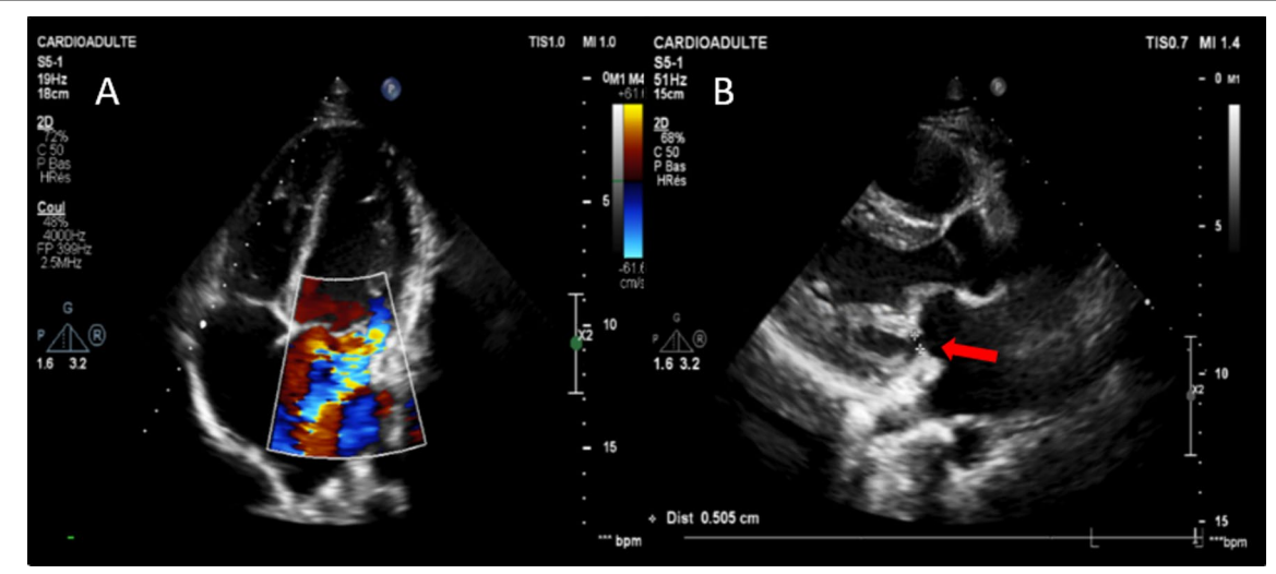
Fig. 2 Transthoracic echocardiogram demonstrating mitral valve regurgitation; a four cavities view showing the eccentric jet of mitral regurgitation; b parasternal long-axis view showing the perforation of mitral posterior leaflet

Given the symptoms and the severity of the mitral valve regurgitation, the decision was taken to proceed with surgical intervention through Minithoracotomy approach. Upon opening of the left atrium and exposure