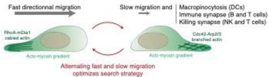
Figure 2: Actomyosin control of migratory patterns of immune cells. In dendritic cells, formin-mediated cabled actin polymerization at the rear of the cell results in fast directional migration. This is reinforced by myosin accumulation at the back by Invariant chain leading to higher contractility at the rear. On the contrary, Arp2/3-mediated branched actin together with Myosin II and Ii at the front of the cell is associated with slow migration and environment sampling by macropinocytosis. Alternance of these two types of migration (whether it is cell intrinsic or environment driven) optimizes search strategy of the environment. Interestingly similar cytoskeleton and migration behaviors have been reported for other immune cells such as T cells of NK cells.

myosin II at the cell front is mediated by its interaction with the MHC class II-associated Invariant Chain (Ii or CD74) [29]. We proposed that diversion of myosin II by Ii from the migratory apparatus at the rear of immature DCs to their front allows the coordination of antigen capture and cell migration. Accordingly, mature DCs, which neither nucleate actin nor recruit myosin II at their front migrate in a fast and continuous manner, similarly to Ii-deficient immature DCs [21, 29]. Consistent with the idea that migration of cells under confinement relies on an actin retrograde flow induced by an increased contractility at the rear of the cell (See first part), the recruitment of myosin II at the front of the cell would perturb the gradient of contractility and as a result would decrease actin flow and thus cell speed [15].