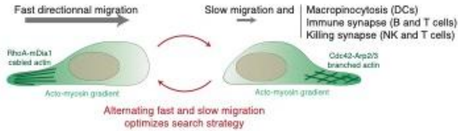
Figure 2: Actomyosin control of migratory patterns of immune cells. In dendritic cells, formin-mediated cabled actin polymerization at the rear of the cell results in fast directional migration. This is reinforced by myosin accumulation at the back by Invariant chain leading to higher contractility at the rear. On the contrary, Arp2/3-mediated branched actin together with Myosin II and Ii at the front of the cell is associated with slow migration and environment sampling by macropinocytosis. Alternance of these two types of migration (whether it is cell intrinsic or environment driven) optimizes search strategy of the environment. Interestingly similar cytoskeleton and migration behaviors have been reported for other immune cells such as T cells of NK cells.

myosin II at the cell front is mediated by its interaction with the MHC class II-associated Invariant Chain (Ii or CD74) [29]. We proposed that diversion of myosin II by Ii from the migratory apparatus at the rear of immature DCs to their front allows the coordination of antigen capture and cell migration. Accordingly, mature DCs, which neither nucleate actin nor recruit myosin II at their front migrate in a fast and continuous manner, similarly to Ii-deficient immature DCs [21, 29]. Consistent with the idea that migration of cells under confinement relies on an actin retrograde flow induced by an increased contractility at the rear of the cell (See first part), the recruitment of myosin II at the front of the cell would perturb the gradient of contractility and as a result would decrease actin flow and thus cell speed [15].