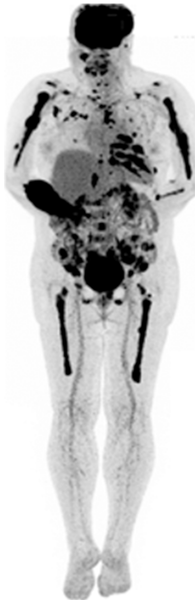
Fig. 1. 18 F-FDG-PET CT Scan: Hypermetabolic lytic bone lesion to the radius, femur, humerus and cranium.

We started a treatment with lenalidomide 25 mg/days 1–14 per os ; bortezomib 1.3 mg/m 2 subcutaneous injection days 1,4,8,11; dexamethasone 20 mg/days 1–2,4–5,8–9, 11–12.