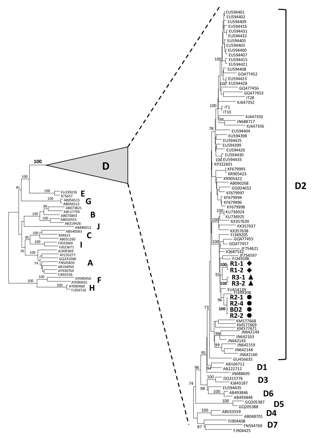
Figure 1 Phylogenetic tree of HBV sequences from infected blood donors and recipients. Sequences included the nearly complete viral genome (2842 nucleotides). Phylogenetic analysis was performed by the neighbour-joining algorithm based on the Kimura two-parameter distance estimation method. Only bootstrap values of >70% are shown (1000 replicates). Reference sequences were taken from GenBank and indicated by their accession code, and genotypes and subgenotypes are indicated. ◆ indicates donor BD1 and recipients R1-1 and R1-2 sequences; ● indicates donor BD2 and recipients R2-1, R2-3 and R2-4; and ▲ indicates recipients R3-1 and R3-2.