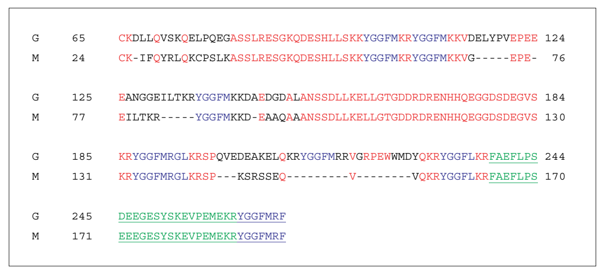
Figure 1. Comparison of invertebrate and mammalian proenkephalin. Common amino acids are shown in red for comparison with the mammalian material, opioid peptides in blue and the enkelytin (green) sequence, including [Met]enkephalin-Arg-Phe (blue) is underlined, G – Guinea pig, M – Mytilus edulis , dashed lines represent spaces in the proenkephalin molecules as determined by a best fit model.