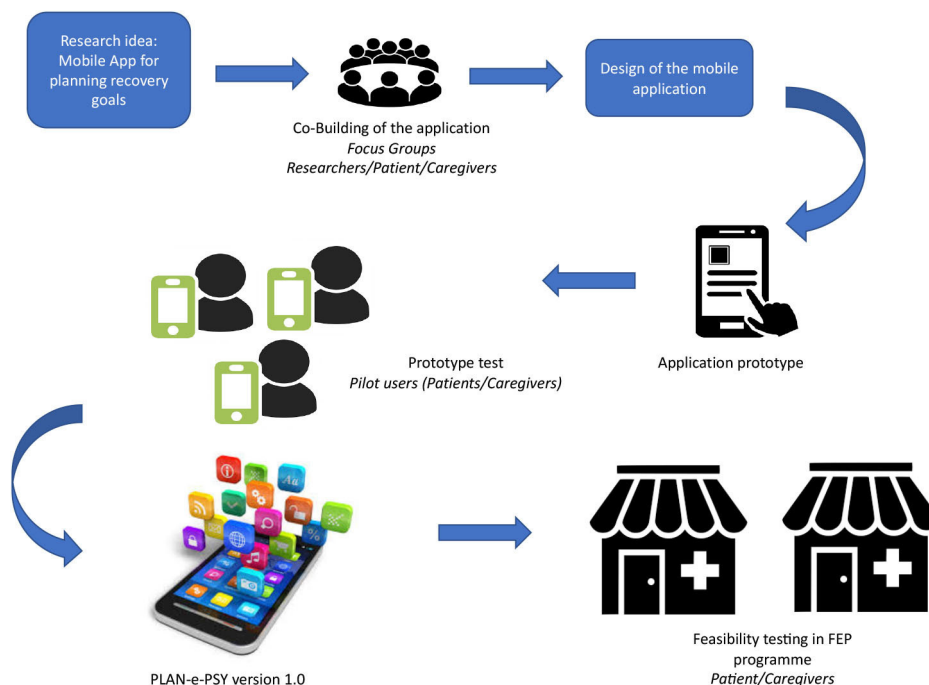
Figure 1 Design diagram of the PLAN-e-PSY application.

The objectives of the workshop phase is the design and prototyping of version 1 of the application. The method