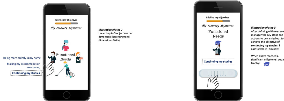
Figure 2 Example of a possible prototype for PLAN-e-PSY.

out to achieve his or her objectives. Each action could require the intervention of a facilitator and/or the use of a psychoeducational information sheet or an online resource that can help the user in their recovery process. The whole process of defining objectives should not exceed 15 days.