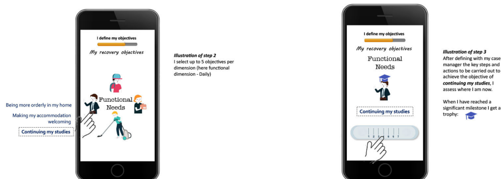
Figure 2 Example of a possible prototype for PLAN-e-PSY.

out to achieve his or her objectives. Each action could require the intervention of a facilitator and/or the use of a psychoeducational information sheet or an online resource that can help the user in their recovery process. The whole process of defining objectives should not exceed 15 days.