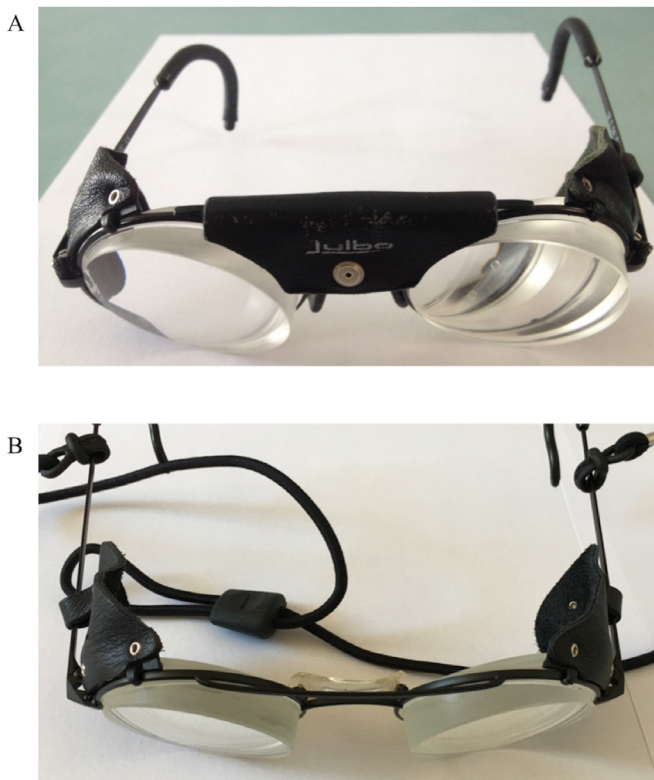
Figure 2 Prismatic glasses (A) and sham glasses (B). (A) A pair of prismatic glasses with an optical deviation of 10 degrees towards to the right side; (B) a pair of sham glasses with a neutral optical deviation.

postural function, the investigators could decide to stop the participation of the subject in the trial.