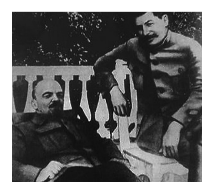
Fig. 3. Stalin visiting Lenin.

Nighoghossian et al.: The Multiple Strokes of the Great Leader of the October Revolution