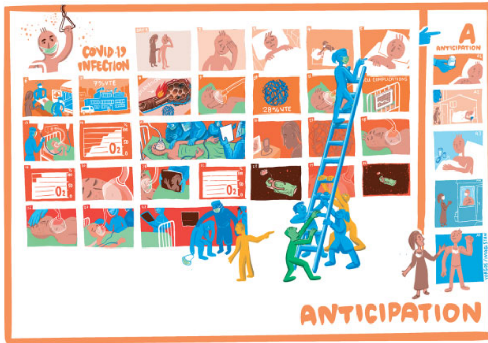
Fig. 3 Illustration of the PDA strategy: anticipation—medical treatment in patients with COVID-19 is essential for improved clinical outcome. Early identification of patients at risk of disease worsening and application of the recommended treatments at the level of the primary health care structures are related with improved clinical outcome and decreased mortality. The first 5 to 7 days after SARS-CoV-2 infection is a critical period for that requires identification of patients at risk of disease worsening and personalized therapeutic strategy . PDA, prevention, detection, and anticipation; VTE, venous thromboembolism.

recommendations of the relevant consensus statements and scientific societies. It is important to renew all of these prescriptions for avoiding any rupture and omission in these vulnerable patients.