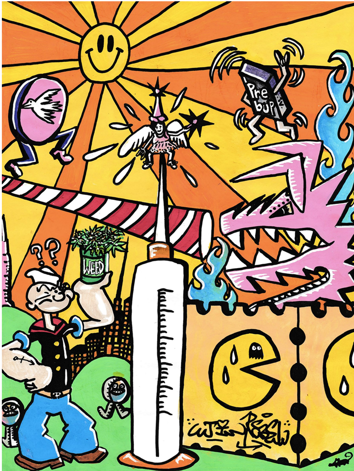
Fig. 2 General artwork of the study. Popeye imagery refers to the common complication of buprenorphine injection characterized by persistent swelling of hands and forearms