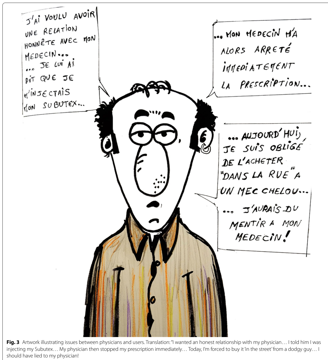
Fig. 3 Artwork illustrating issues between physicians and users. Translation: "I wanted an honest relationship with my physician... I told him I was injecting my Subutex... My physician then stopped my prescription immediately... Today, I'm forced to buy it 'in the street' from a dodgy guy... I should have lied to my physician!"

as some reported that their prescription was stopped after disclosing to their physician that they injected their buprenorphine. Stigma towards people who inject drugs (PWID) is frequent in healthcare settings and is associated with negative health outcomes and limited access to OAT [26]. Implementing prescribed IV buprenorphine as a new treatment strategy might reduce stigma associated