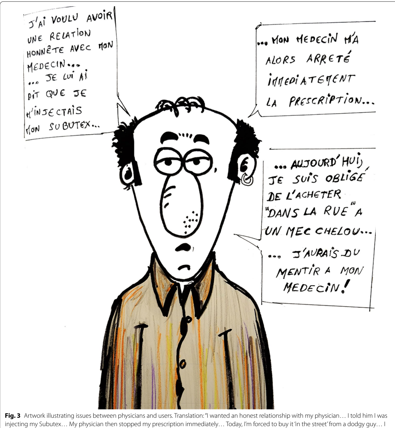
should have lied to my physician!

as some reported that their prescription was stopped after disclosing to their physician that they injected their buprenorphine. Stigma towards people who inject drugs (PWID) is frequent in healthcare settings and is associated with negative health outcomes and limited access to OAT [26]. Implementing prescribed IV buprenorphine as a new treatment strategy might reduce stigma associated