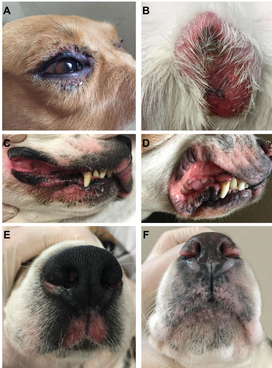
Fig. 2 Cutaneous lesions in the dogs. A: Erythematous, ulcerated eyelid lesion at day 14. B: Erythematous, exudative lesion of the scrotum at day 14. C: Erythematous lips lesion at day 14. D: Depigmented lips lesion at day 24. E: Erythematous nasal planum lesion at day 14. F: Depigmented nasal planum lesion at day 28

interface dermatitis were characterized by mild to moderate basal cell vacuolar degeneration, a few apoptotic bodies in the basal layer, and mild lymphocytic infiltrate at the dermal-epidermal junction (Fig. 3A). These lesions sometimes extended to the follicular infundibulum. The basement membrane was multifocally thickened (Fig. 3B). Pigmentary incontinence and/or mild to moderate acanthosis were often present. Ulcerated areas were covered with serocellular crusts and associated with moderate neutrophilic infiltrates in the superficial dermis. Areas of erosion displayed pustules and crusting and