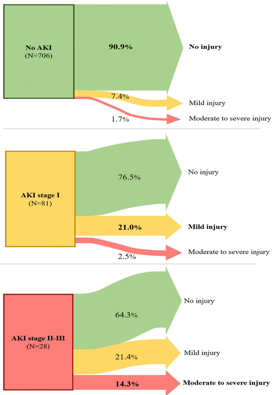
Fig. 2 Renal outcomes 1 y after surgery according to postoperative acute kidney injury (AKI) stage

This is not surprising as we included only patients who had had high-risk abdominal surgery that carries a greater risk of postoperative renal dysfunction than low-risk abdominal surgery. Moreover, major surgery is a well-known contributing factor for postoperative AKI [22]. This increased risk is likely due to larger fluid shifts, blood losses and a relatively high incidence of perioperative hypotension in these patients, all of which can compromise renal blood flow [23–26]. Moreover,