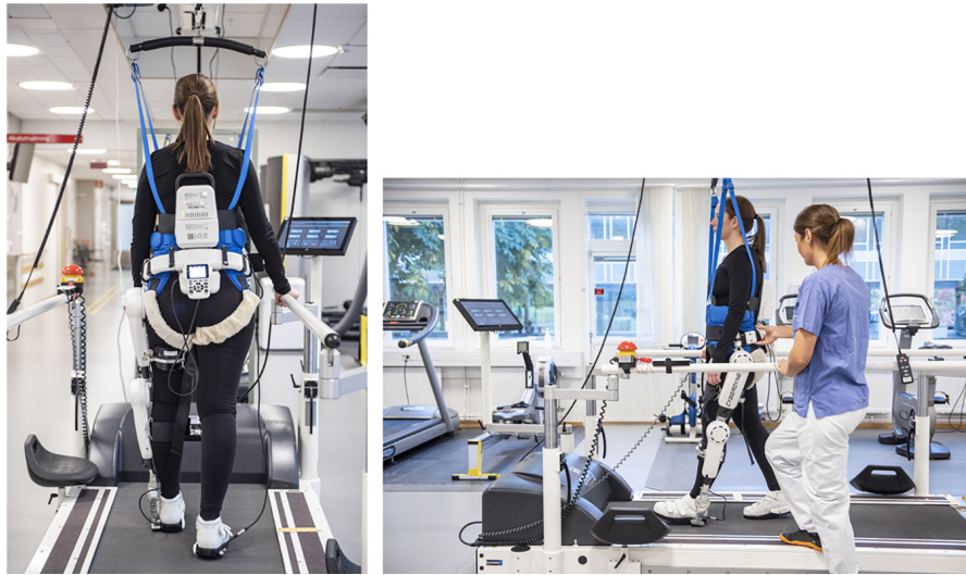
FIGURE 1 | HAL used on a treadmill with body weight support (BWS). Consent for publication was obtained from the persons in the pictures (photo: Johan Adelgren).

Results showed large improvements in sensorimotor function, activity and independence in walking but with no significant between group differences (Wall et al., 2020).