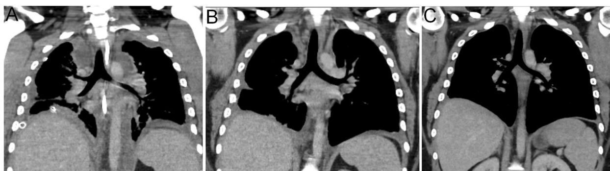
Fig. 3 (a) Day 7 CT scan- acme of the mediastinal infiltration, with abscesses formation (3 days after surgery); (b) CT scan at M1 after intensive care unit admission; (c) CT scan at M2 after intensive care unit admission

continued for 6 more weeks for a total of 10 weeks of treatment.