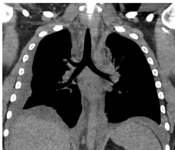
Fig. 1 Chest CT scan of the initial presentation of the mediastinitis, with diffuse mediastinal infiltration

Blood tests were consistent with a marked inflammatory syndrome with a high leucocytes level (41,000 /mm 3 ; 82% of neutrophils) and a CRP of 450 mg/l. Procalcitonin was 3.3 ng/ml and lactate was 1.31 mmol/l. Neck and chest CT-scan revealed an enlargement of the mediastinum due to a diffuse mediastinal infiltration with a moderate bilateral pleural effusion (Fig. 1), without lung parenchymal, pharyngeal and neck abnormalities or jugular venous thrombosis. Esophageal perforation was ruled out by a Barium swallow test and esophagogastroduodenoscopy. Community-acquired mediastinitis being suspected,