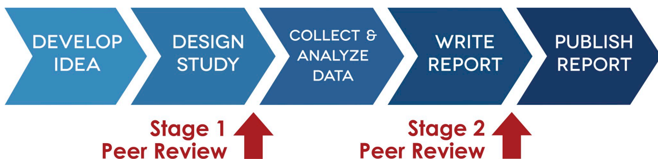
Fig 2. Each blue arrow in the diagram represents a research step that requires documentation. Each red arrow is an opportunity for a preprint.

Document and publish often and in detail, including experimental designs and negative results, to receive feedback and detect and resolve errors early in the process [107]. Errors occur in public and in private, and while "making code and data open does not prevent errors, [...] it does make it possible to detect them. [...] People often worry that if they make their