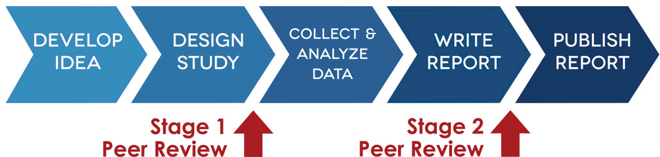
Fig 2. Each blue arrow in the diagram represents a research step that requires documentation. Each red arrow is an opportunity for a preprint. Image source: [157].

Document and publish often and in detail, including experimental designs and negative results, to receive feedback and detect and resolve errors early in the process [107]. Errors occur in public and in private, and while "making code and data open does not prevent errors, [...] it does make it possible to detect them. [...] People often worry that if they make their