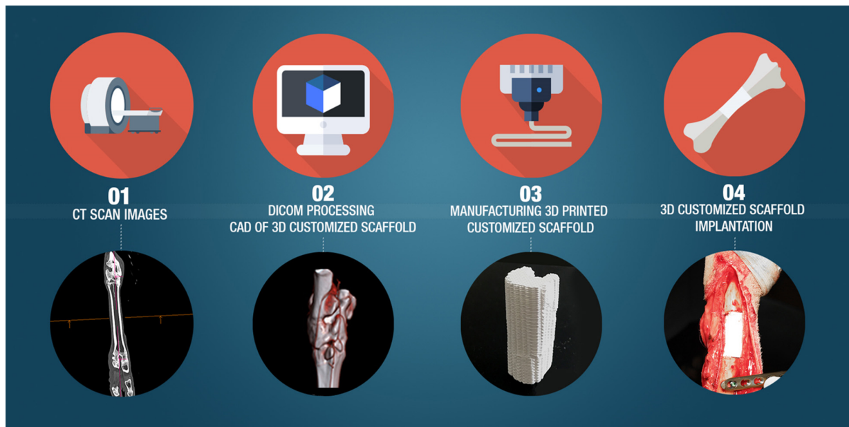
FIGURE 3 | Workflow involved in customizable bone construct fabrication. (1) CT scans of the patient's bone are acquired. (2) Computer aided software enables the processing of CT images in order to (3) 3D print personalized scaffolds for (4) bone defect reconstruction. The lower panel illustrates a real large bone defect reconstruction in a sheep metatarsal bone model.