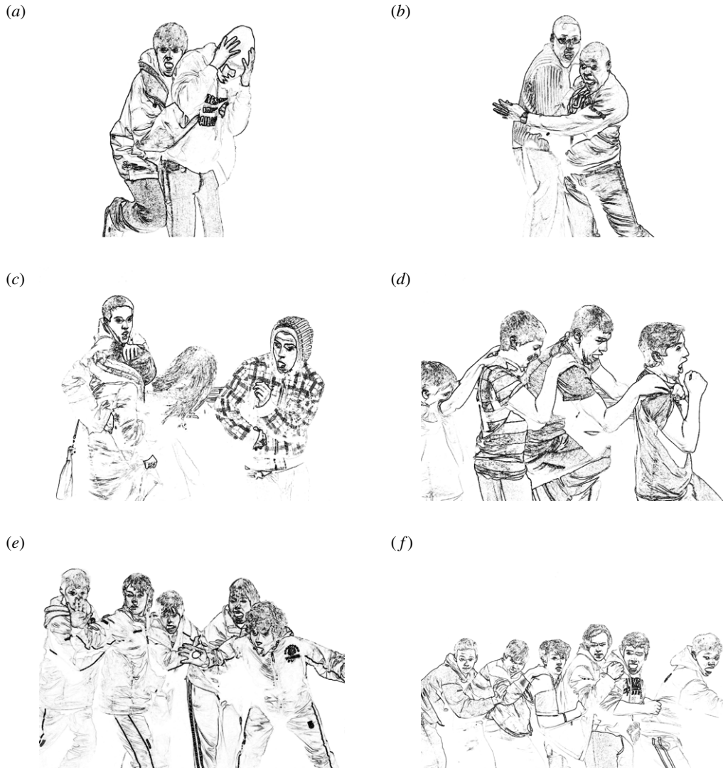
Figure 1. Example of photographs redrawn (note that real photographs were used for coding; they can be found at: https://www.flickr.com/photos/nightmaresfearfactory ). (a) Showing individual 1 (left) gripping individual 2 (right). (b) Showing a mutual gripping between individuals 1 and 2. (c) Shows a pattern common in the dataset, the total absence of mutual gripping in a large group. Individual 1 (at the very left) is at the end of the queue.

many people she was gripping. Finally, coders counted the number of grips the individual was giving and that were mutual. Two-hundred and sixty data points (circa 20% of the total sample) were then double-coded by a research student. Except for the 'hiding' variable ( \kappa hiding less than 0), all of the other variables reached strong agreement between judges, as measured by kappa scores ( \kappa sex = 0.98; \kappa age class = 0.65; \kappa group size = 0.98; \kappa fearfulness = 0.61; \kappa gripping = 0.84; \kappa number of individuals being gripped = 0.83; \kappa number of grips being mutual = 0.78).