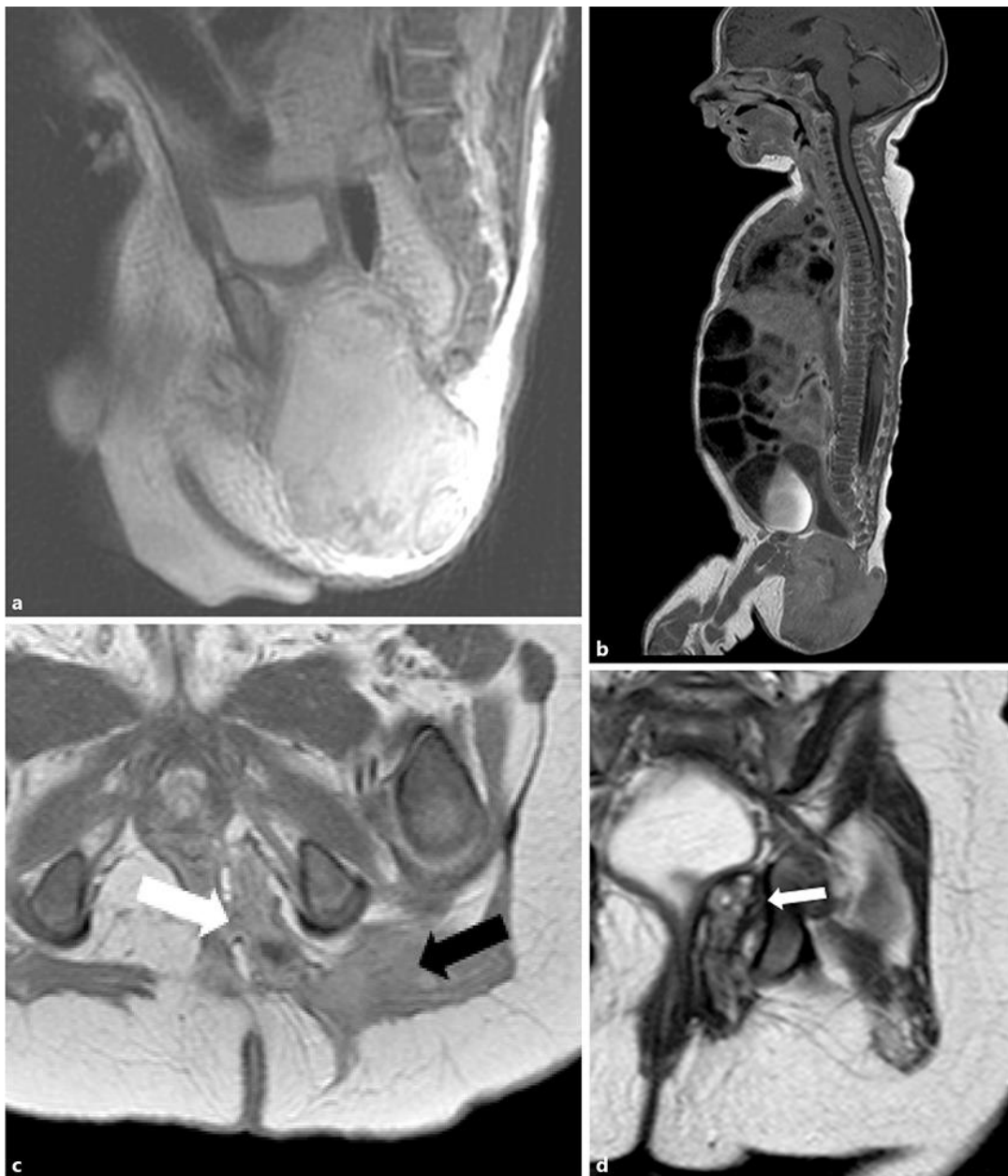
Fig. 2. Diagnostic and on-therapy MRI. (a) At diagnosis: Sagittal section in T2 sequence. Tumor mass measuring 49 \times 37 \times 48 mm. (b) After 2 courses of Vincristine Cyclophosphamide: Sagittal section in injected T1 sequence. Tumor mass measuring 72 \times 74 \times 56 mm. (c) After 4 courses of ICE: Axial section in T1 sequence with gadolinium injection. The white arrow shows the pelvic portion of the tumor in the left ischial fossa. The black arrow shows the intra muscular portion in the left gluteus maximus muscle. (d) After 4 courses of ICE: Coronal section in T2 sequence. The white arrow shows the pelvic portion of the tumor in the left rectal ischio fossa.