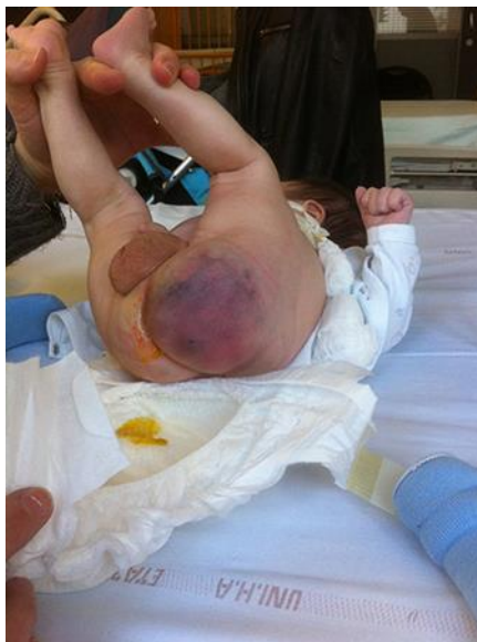
Fig. 1. Diagnostic: Soft and mobile mass with bruise-like appearance measuring 4 cm in the newborn's left buttock, with a deflection of intergluteal sulcus and anal margin to the right.