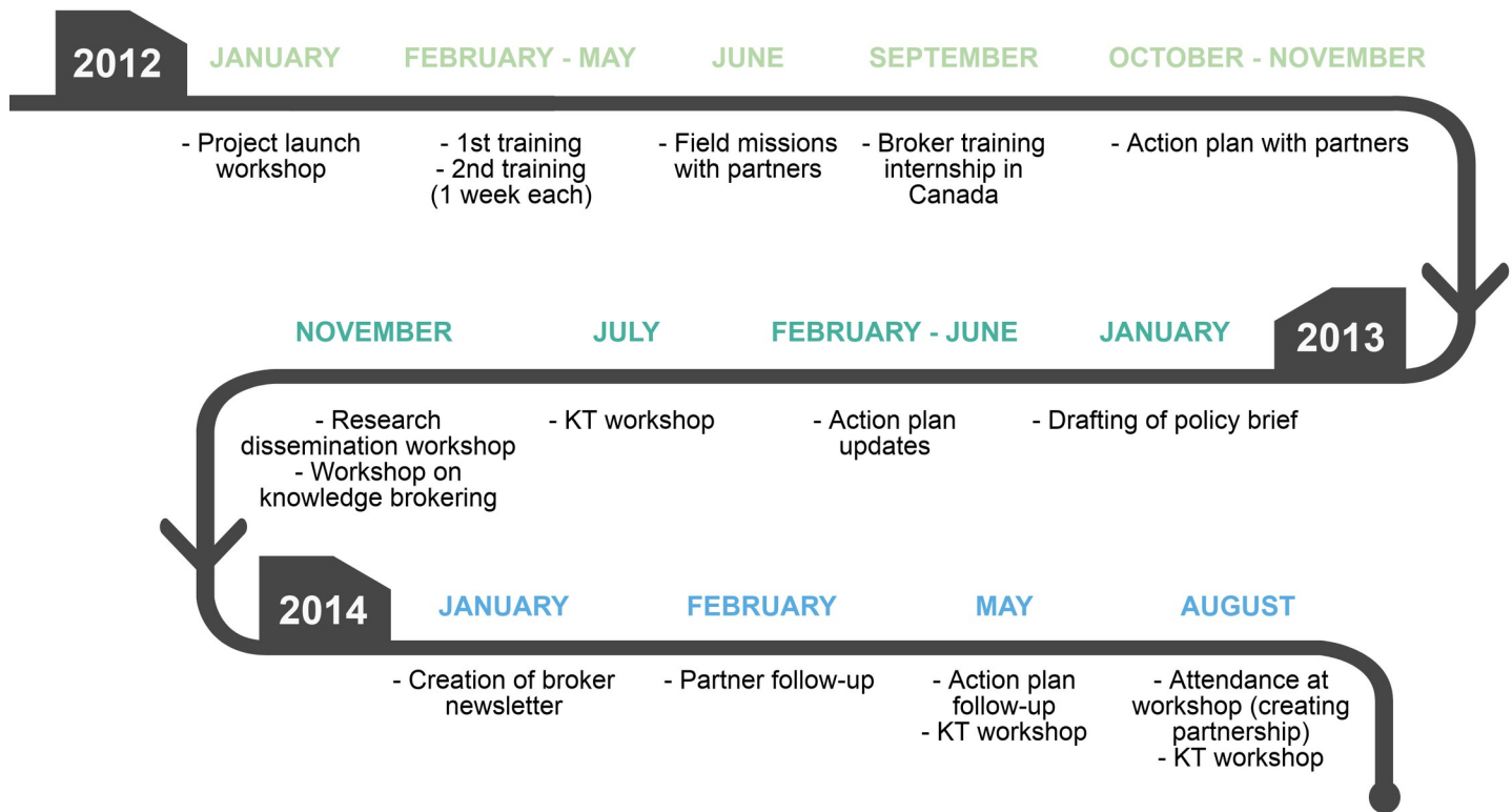
Fig 1. Chronology of the intervention. The main knowledge brokering activities carried out during the three years of implementation (2012 to 2014) of the intervention are summarily described.

https://doi.org/10.1371/journal.pone.0220105.g001