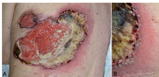
Fig. 2. (A) Pyoderma gangrenosum of the back 10 weeks after the start of treatment. (B) Pustules on the edge of the ulcer.

1 https://www.medicaljournals.se/acta/content/abstract/10.2340/00015555-2890