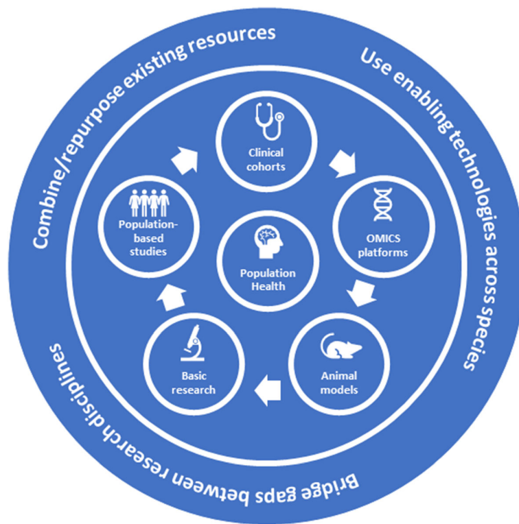
Fig. 2 Translational model of reserve against neurodegenerative disease