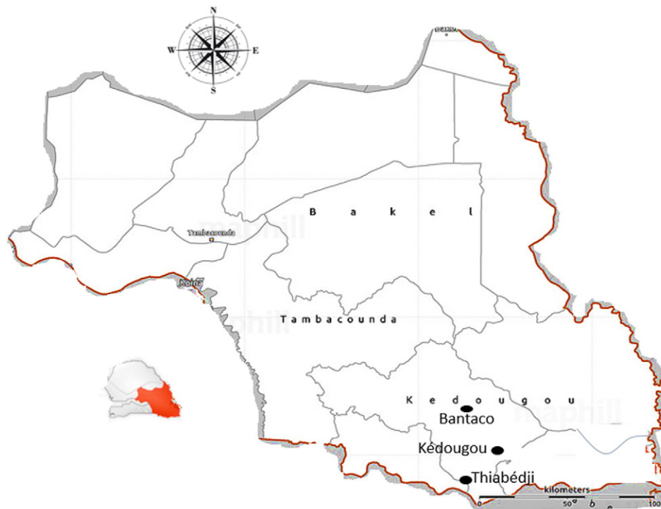
Fig. 1. Map of Kedougou region with the different localities of origin of the different isolates of this study.

Suckling mice derived viruses were identified by reverse transcription PCR targeting a segment at the partial NS5 gene using the generic