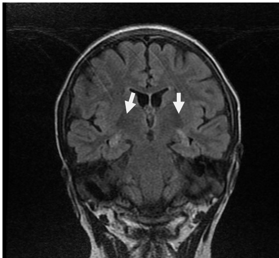
Fig. 2 A coronal FLAIR sequence with thin cuts showing bilateral hippocampal sclerosis (white arrows).