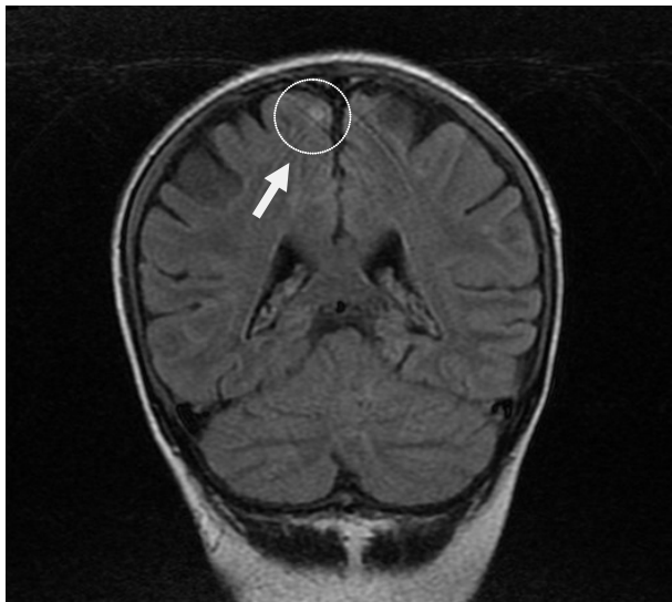
Fig. 3 A coronal FLAIR sequence with thin slices in the same patient showing a hyperintense cortical lesion most probably a focal cortical dysplasia (white arrow and white outline).