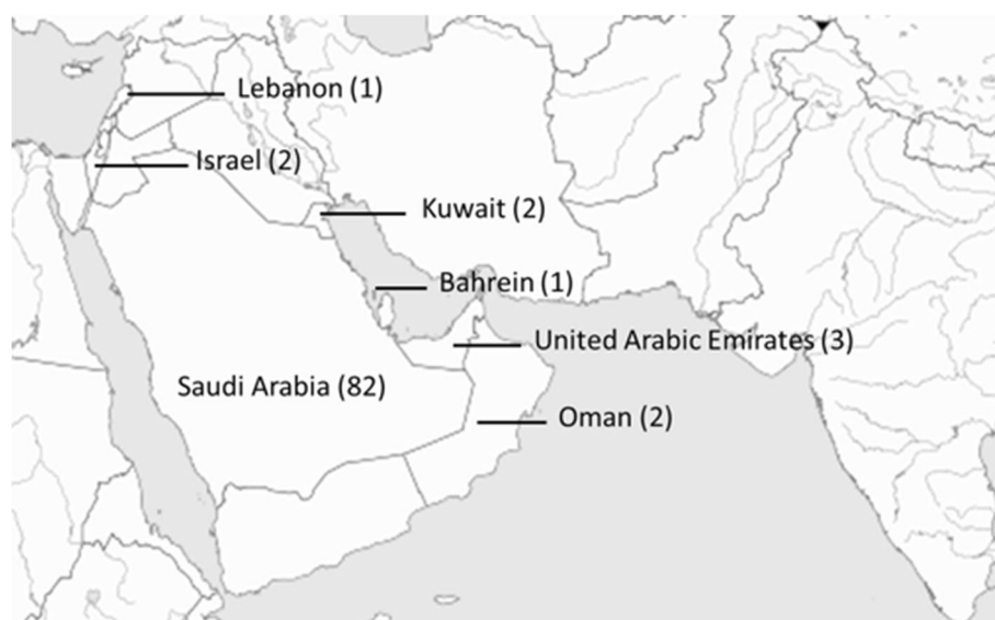
Fig. 1 Geographic distribution of the 93 patients prior to their hospitalization in an isolation ward for suspected MERS-COV infection.

Seventy-five (80.6%) patients had underlying medical conditions with a median of 2 (1–3) different comorbidities