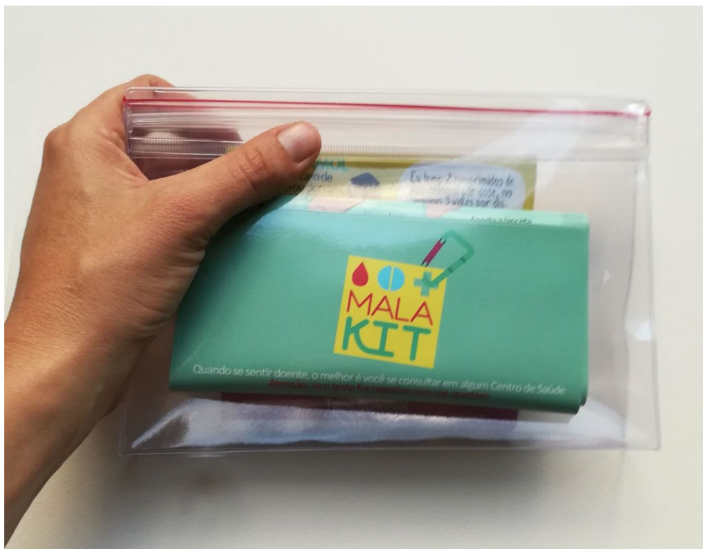
Fig. 2 Self-diagnosis self-treatment kits

potential interactions with cardiac treatments, and the insufficiency of drug absorption in case of vomiting. In those cases, participants will be invited to start the treatment and rapidly consult at a health centre. The clinical signs have been defined by the Malakit scientific committee in a way that should easily be recognizable by participants. Women will be informed that in case of pregnancy, they should not take primaquine, and that a medical consultation is recommended.