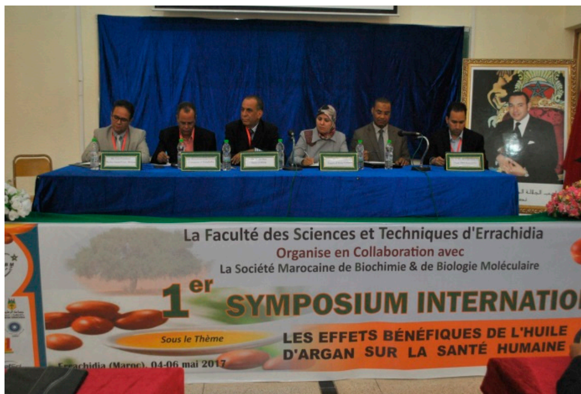
Picture 1. Opening session of the 1st symposium on argan oil by the officials.