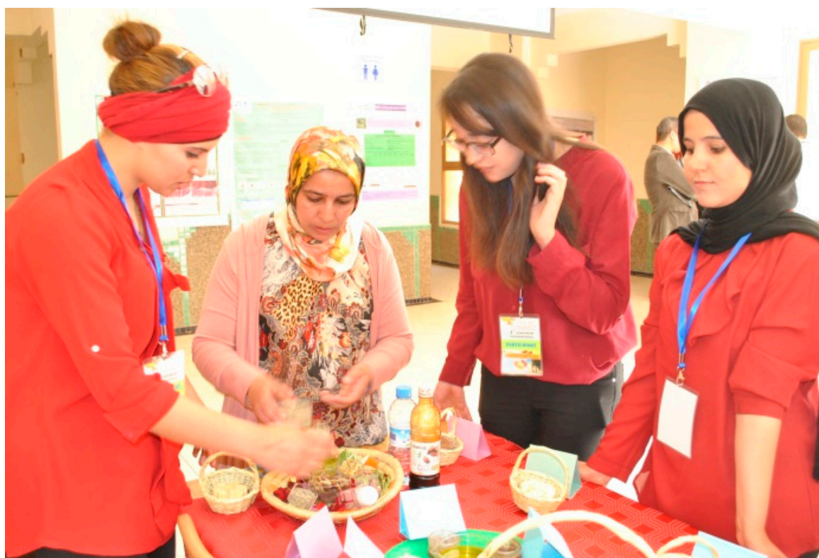
Picture 2. Presentation of food products and cosmetics with bases of Argan oil.