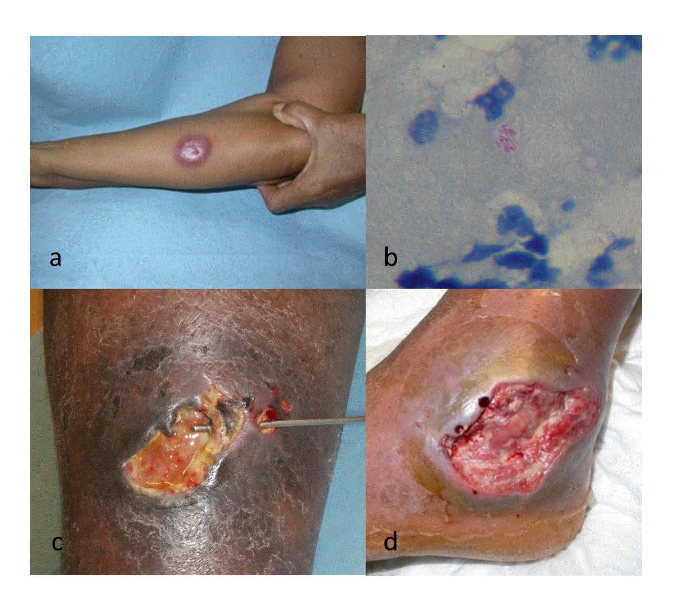
Supplementary Photograph: Mycobacterium ulcerans infection among three patients in French Guiana: a. nodule on the fore-arm; b. Ziehl coloration of a smear: red coloration of bacillus; c. plaque on the leg with ulcerations with undermined edges; d. ulcer on the ankle.