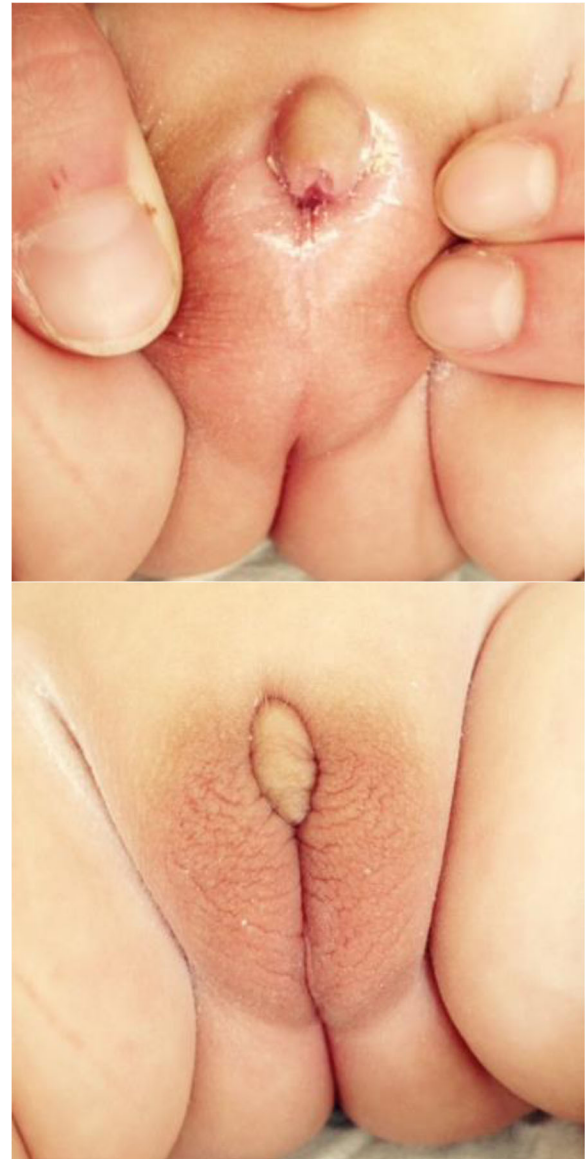
Fig. 3 External genitalia at two months of age

Irrespective of potential technical benefits of performing surgery later in life, a major ethical advantage stems from the fact that the patient herself can be involved in the decision to proceed or not with an operation to the clitoris, taking into account the implications of surgery, the benefits to appearance and the possible risks to genital sensation and sexual function. It is perceived that a number of patients may opt against surgery all together as they grow, either because of a decreased size of the clitoris (relative or true) or because of a concern of effects of surgery on genital sensitivity. In either case it can be her choice to proceed to a clitoral reduction, even if the parent or guardian still has the legal responsibility for the operation.