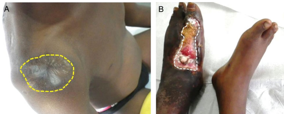
Figure 3. Typical group 2 clinical form (old spontaneously healed Buruli ulcer and an active lesion [n = 13]). The patient presented (A) a stellate scar on the upper part of the right arm, 8 cm in diameter (B) a typical active Mycobacterium ulcerans ulcerative lesion on the left foot, measuring approximately 10 × 5 cm. The lesion had undermined edges and was painless. Mycobacterium ulcerans infection was confirmed by polymerase chain reaction and acid-fast bacilli on tissue extracted from this lesion. The yellow dotted line circumscribes the scar area with a stellate appearance (edema). The white dotted line circumscribes the active lesion (ulceration).

suggests that the immune response involved in healing cannot sterilize the tissue, or even confer protection against M. ulcerans . Therefore, the development of a vaccine against M. ulcerans may be compromised. It seems unlikely that the occurrence of a second lesion is due to a second contamination event involving the inoculation of the skin with the bacillus. Given the high rate of osteomyelitis observed in second lesions, it seems more likely that M. ulcerans disseminates systemically, as suggested by other studies [14, 16, 19, 24].