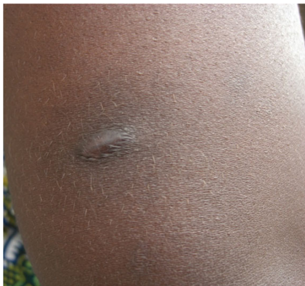
Figure 4. Complete spontaneous healing of a Mycobacterium ulcerans lesion. Scar resulting from the spontaneous complete healing of a nodule in a woman who received no treatment.

The single patient in group 3 provides a formal demonstration of the possibility of spontaneous healing of Buruli ulcer without the intervention of Western or traditional medicine.