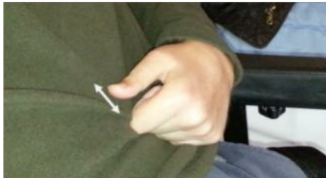
Figure 1: Matthieu's thumb movement

The SOFTWARE KEYboard Toolkit [6] has been used to design MATT's scanning system. This platform enables to design virtual keyboards for communication, environment control, and computer application like Internet or audio message linked to a key. This platform permits to choose the type of interaction –pointing or scanning –and its settings. It also offers highly reconfigurable options to adapt the MATT system to the abilities of the user.