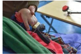
Figure 2: Matthieu's switch position