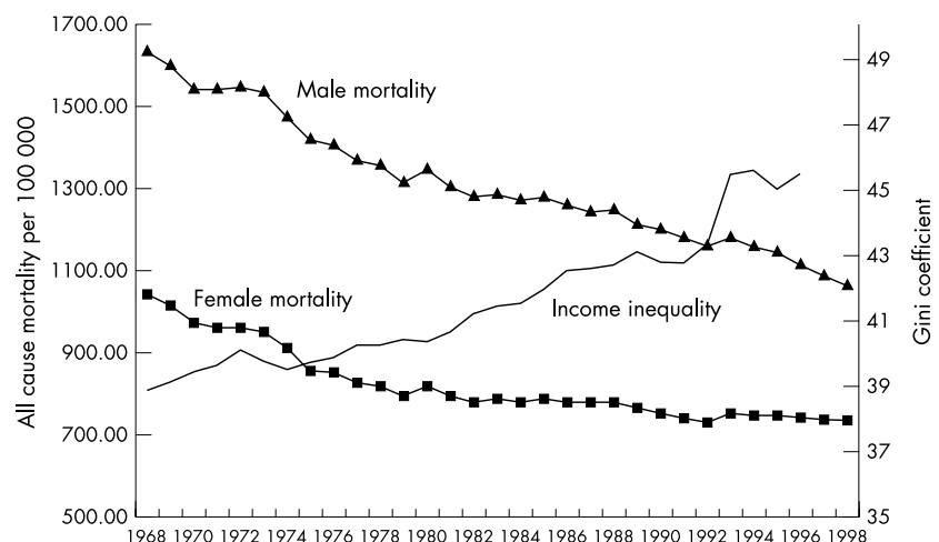
Figure 1 Income inequality (Gini) and sex specific, age adjusted, all cause mortality USA, 1968–1998.

the work of Weitekamp and Wildner, who basically develop the ongoing argument as to whether it is appropriate to adjust for covariates that may be causal intermediates—rather than confounders—in statistical models. 18 They show that such adjustment will tend to accentuate apparent effects of factors more proximal to the outcome. In other words in the case of psychosocial factors that may mediate the relation between social position and health adjustment will tend to lead to the psychosocial measure appearing to have an effect “independent” of that of the more distal (and perhaps determining) social position measure. Psychosocial exposures are amenable to experimental manipulation. 19-21 If they weren’t how could they form the basis for useful health interventions? Experiment remains the most powerful means of reducing the risk of being misled by confounding and selection bias (with “Mendelian randomisation”—in essence a natural experiment—a close second). 22 We doubt that Dr Singh-Manoux is really suggesting that we abandon randomised controlled trials in favour of observational studies analysed using structural