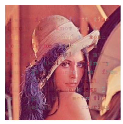
(g) OptSpace (PSNR: 26.492)