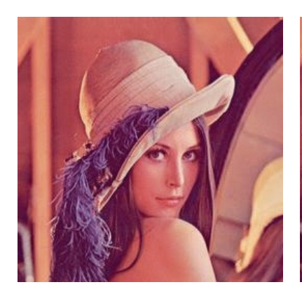
(a) Original image (256 \times 256)