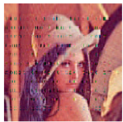
(f) SVP (PSNR: 22.159)