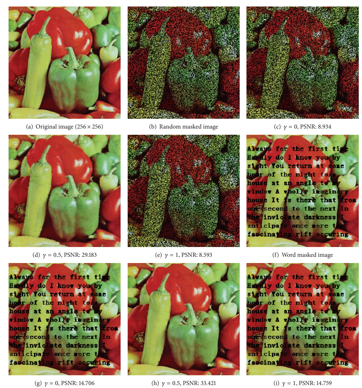
FIGURE 1: The recovered results with 60% random mask and word mask for \gamma = 0, 0.5 and 1 by LTVNN.

Theorem 2. Assuming that the sequence of step size obeys 0 < \inf \lambda_k < \sup \lambda_k < (2\alpha/\beta), \alpha = \langle (\mathbf{X}^k - \mathbf{X}^*)(\mathbf{I} - \phi_1 - \phi_1^T + \phi_1\phi_1^T), \mathbf{X}^k - \mathbf{X}^* \rangle and \beta = \|\mathbf{X}^k - \mathbf{X}^*\|_F^2 . Here, \mathbf{X}^* denotes the optimization result and \mathbf{X}^k denotes the kth iteration object variable; then by the iteration procedure defined in Section 2.3, we can obtain the unique optimization result, that is, \mathbf{X}^* . And the details of the proof can be found in the Appendix.