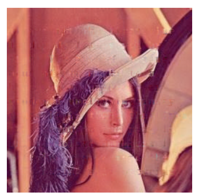
(d) TNNR (PSNR: 30.189)