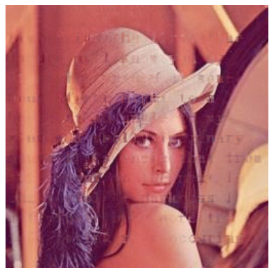
(e) SVT (PSNR: 30.760)