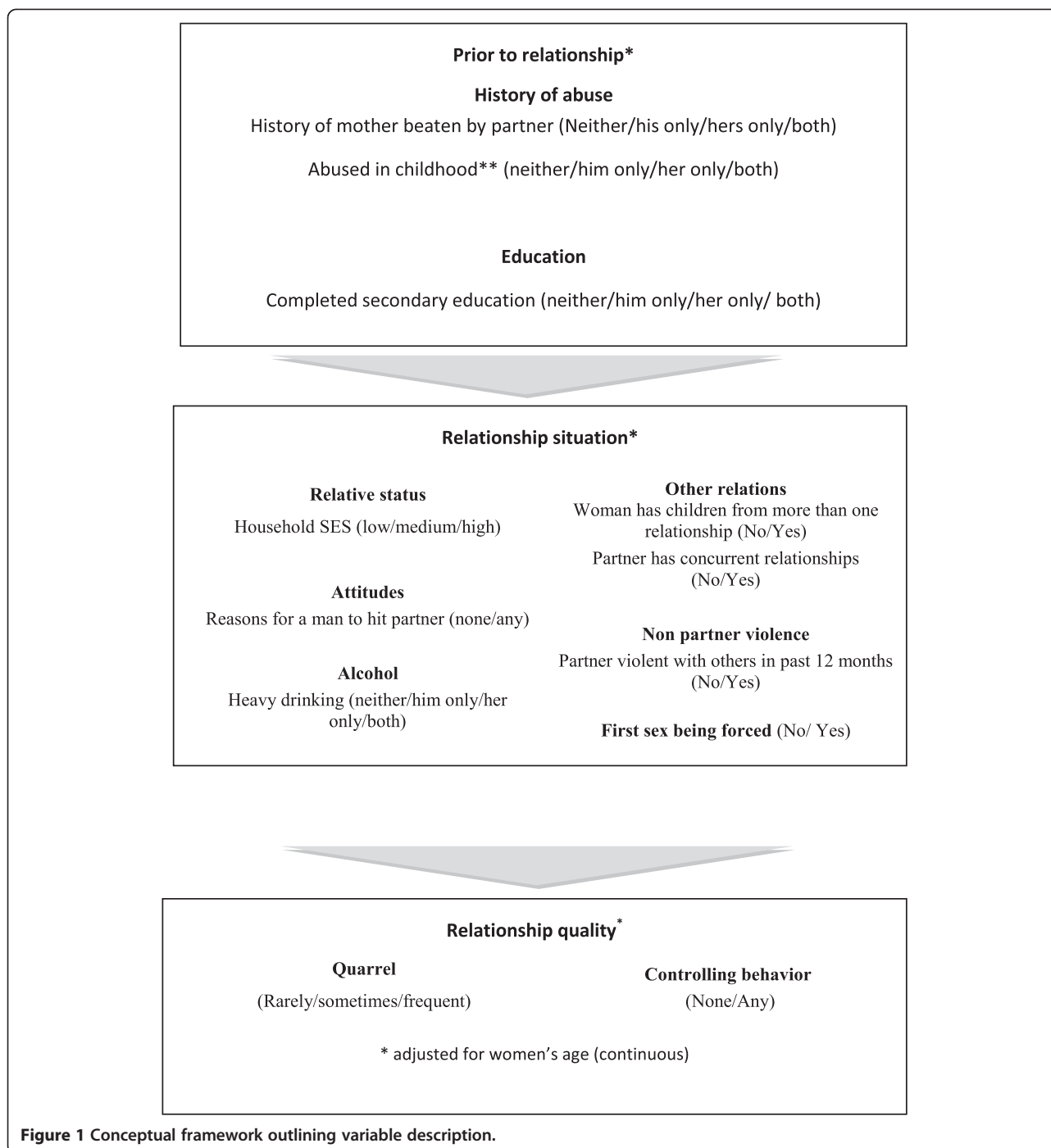
Figure 1 Conceptual framework outlining variable description.

their current relationship and factors indicative of the overall relationship quality. Variables that were included in the analysis that occurred prior to the relationship include whether the woman's or her partner's mother was beaten or both, whether the partner was physically and the woman sexually abused during childhood or both and whether the woman and her partners have a secondary education or both. Variables investigated at the current relationship level include the woman's household status