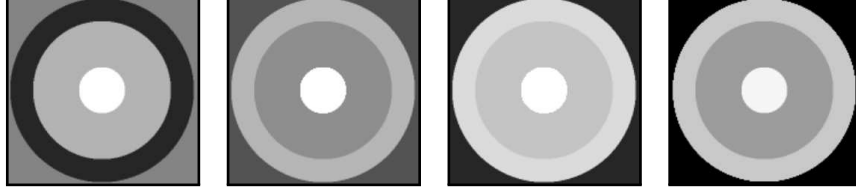
Fig. 1. The synthetic phantom. From left to right: B_1 , T_1 , T_2 and M_0 reference maps.

into an MRI simulator 2 in order to synthesize T_1 and T_2 relaxometry sequences following signal equations from Sect. 2.1 with \alpha accounting for B_1 . Then we added Rician noise to the simulated relaxometry sequences (SNR= 20dB). The estimation was run with the regular DESPOT1 and EPG estimations (Sect. 2.1) and with the proposed method. The results were then compared to the reference values to quantitatively evaluate our algorithm.