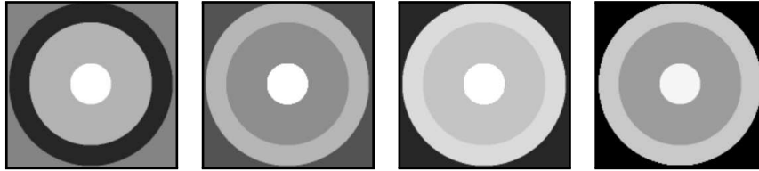
Fig. 1. The synthetic phantom. From left to right: B_1 , T_1 , T_2 and M_0 reference maps.

into an MRI simulator 2 in order to synthesize T_1 and T_2 relaxometry sequences following signal equations from Sect. 2.1 with \alpha accounting for B_1 . Then we added Rician noise to the simulated relaxometry sequences (SNR= 20dB). The estimation was run with the regular DESPOT1 and EPG estimations (Sect. 2.1) and with the proposed method. The results were then compared to the reference values to quantitatively evaluate our algorithm.