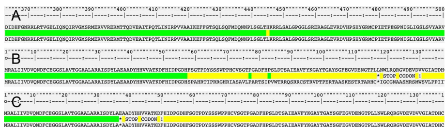
Figure 4 Protein alignment and detected mutations. A shows the detection of a mutation. B shows frameshift creation. C shows stop-codon creation. The whole alignment can be observed by horizontally scrolling the alignment window. These representations emphasize the effect of the mutation on the protein chain to provide solid understanding in terms of establishing therapy and monitoring.