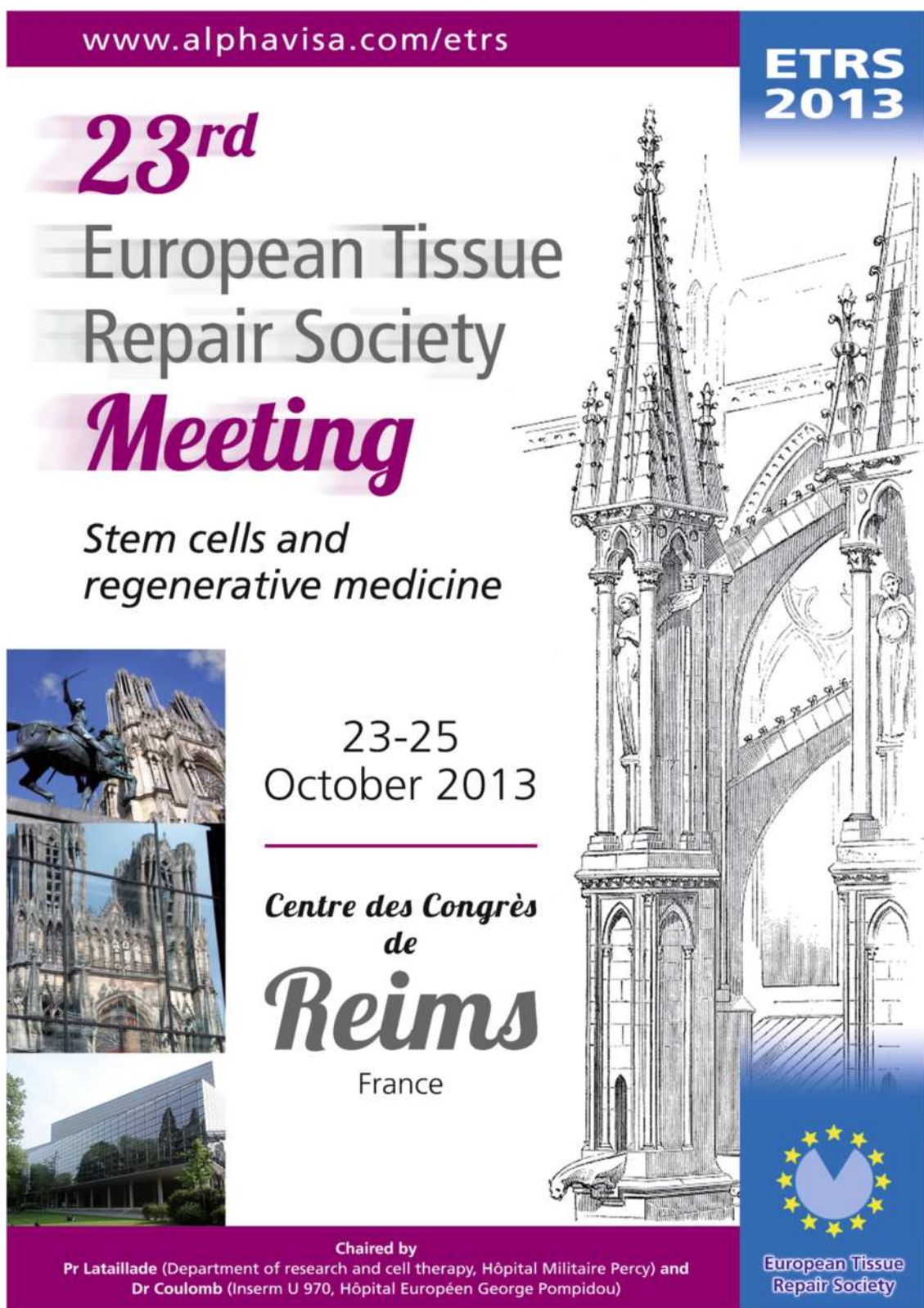
Figure 1 Flyer of the 23 rd Annual Meeting of the European Tissue Repair Society.