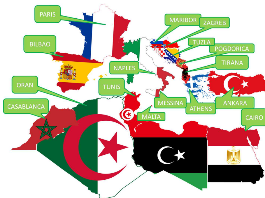
Figure 1 Map of referral centers in the participating countries.

Based on the facilities and tests available in each center, for each case we estimated the probability of being diagnosed with CD by the new ESPGHAN diagnostic criteria alone, without small intestinal biopsy. For each case we summed up the number of diagnostic criteria met (clinical symptoms, tTG above 10 folds the upper limit of normal and specific HLA). The sum of the criteria determined the final diagnostic score, which thus ranged from 1 to 3. To reduce large tables, countries were often aggregated within their geographical region (Europe, Balkans, North Africa).