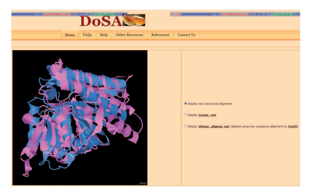
Figure 2. Visualization of the pairwise structural alignment with the Jmol applet. The structural alignments are based on improved structure-based sequence alignments, as seen in Figure 1. Users can also view individual protein domain structures using the Jmol applet by clicking on the buttons.

Figure 1. Example of one representative pairwise structural alignment. In pairwise structure-based sequence alignments, the two sequences are given as classical sequences alignments. They are identified through their domain ID, the amino acid sequence being the first written, the second line being the PB sequence. SCRs are shown in uppercase and blue. Conformationally similar and dissimilar SVRs are shown in lowercase green and red, respectively. Corresponding PB sequences are shown with a gray background. Under the SVRs are given their personal SVR scores. The different metrics to assess the quality of SVRs are displayed as a mouseover event in a text box.